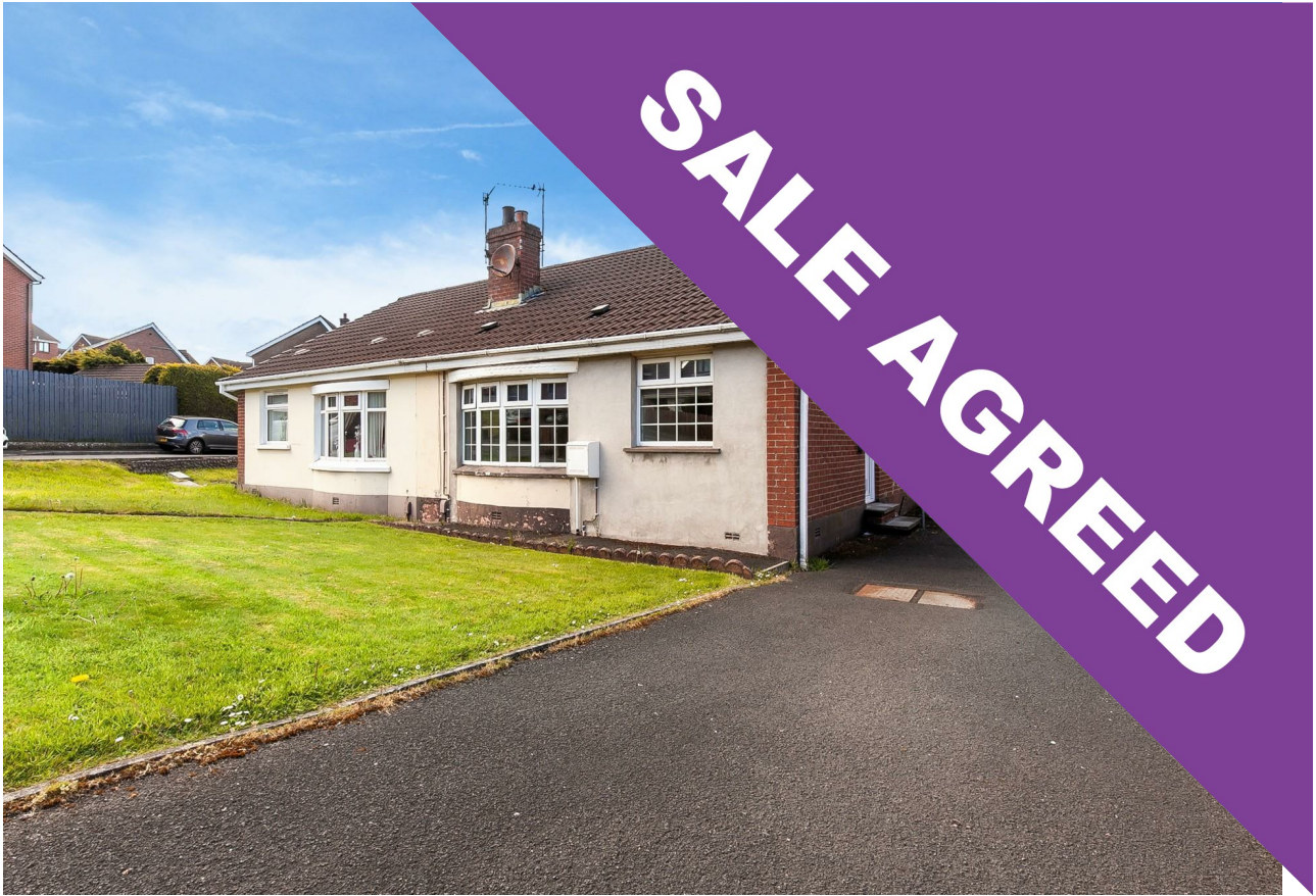
5 Hollybrook Avenue, Newtownabbey, BT36 4ZL